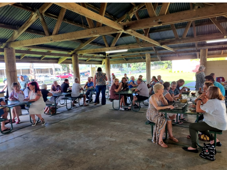
Above: Thanks to the volunteers who came to the feedback meeting and BBQ at The Branding Rail in December. It was great to share ideas over a few drinks and a meal. We appreciate your support.