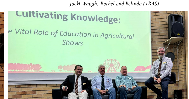
Presentations included: The vital role of Education in Agricultural Shows and Navigating the next 5-10 Years for Agricultural Shows.

Future Horizons: Navigating the Next 5-10 Years for Agricultural Shares