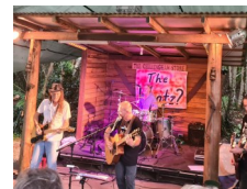
JB'S Blues Breakers